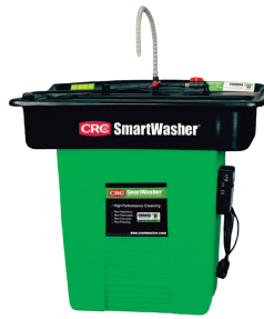
SW-28 SuperSink Parts Washer