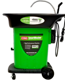
SW-33 Mobile Parts Washer