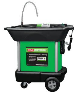
SW-37 Mobile Heavyweight Parts Washer